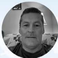
Rayburn Dedam Esgenoôpetitj First Nation