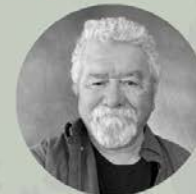
Nelson Cloud North Shore Mi'kmaq Tribal Council