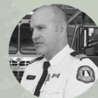
Bruce Lake Halifax Fire